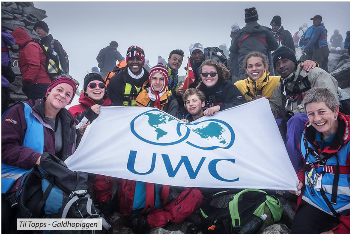
Til Topps - Galdhøpiggen